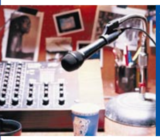
Antena 3 closed the year with spectacular results, obtaining operating income of 28.252 billion pesetas and taking the lead in private European television profitability.